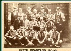
BLYTH SPARTANS 1901-2